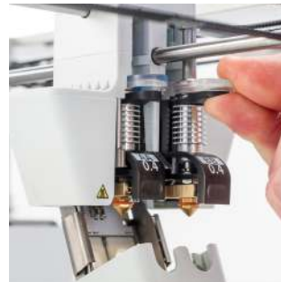
Print cores AA and BB Quick-swap nozzles for build and water-soluble support materials